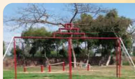
SSB Training Centre