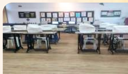
Fashion Designing Lab