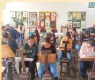
Fine Arts Lab